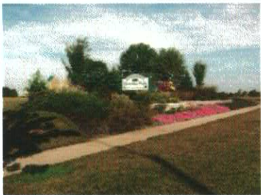
Maxwell Park Planter- completed