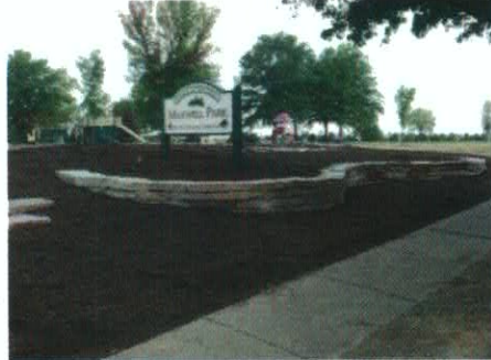
Maxwell Park Planter- ready to plant