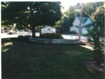
Fell Park Planter- wall finished, plants this spring!