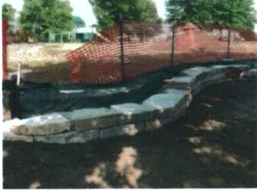
Maxwell Park Planter- taking shape